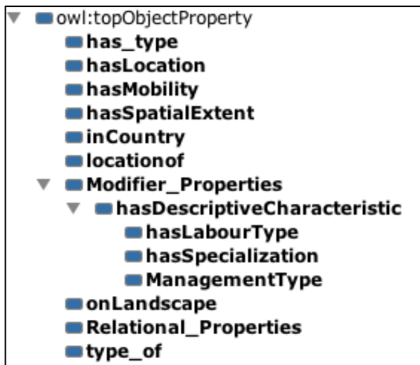
Figure 2: Object Property Screenshot

architecture. A figure of the hierarchy of object properties can be seen in Figure 2. All object properties except the subproperties of Modifier_Properties and type_of have domains and ranges corresponding to the classes they influence. Properties type_of and has_type are inverses and defined as such. All of these properties are transitive or functional and none of