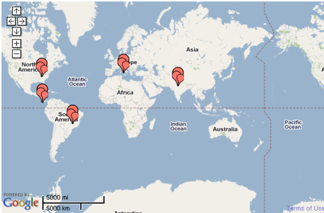
Fig. 4. A geographic map of the physical location of the registered services

The services featured in the RING are submitted directly by their managers and technical staff, which ensures ownership and reliability of the data. Any person who is responsible for an information service can register it. Each record describing a service must link to the record of an organization / institution registered in the system: these records can be created on the fly while registering the service or can be just referenced if they exist. A mandatory element is the email address of the institution: in order to ensure the correctness of attribution of the services to their owners, the organizations responsible for the service will be alerted upon submission and periodical checks will be run by the RING administrators.